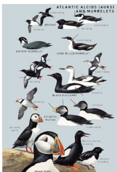
Atlantic Alcids (Auks) and Murrelets