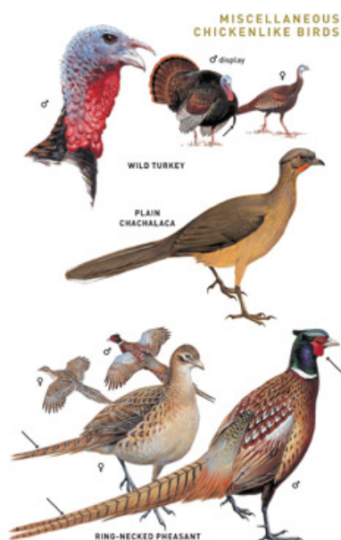
Miscellaneous Chickenlike Birds