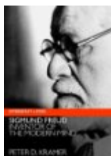
Freud: Inventor of the Modern Mind by Peter Kramer