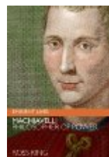
Machiavelli: Philosopher of Power by Ross King