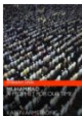
Muhammad: A Prophet for Our Time by Karen Armstrong