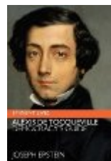
Alexis de Tocqueville: Democracy's Guide by Joseph Epstein